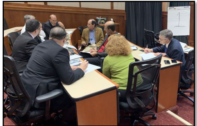
Summit participants broke into small groups to discuss opportunities for collaboration.

Manufacturers and regulators need consistent standards for common vehicle communication systems and Intelligent Transportation Systems (ITS) across states. MAASTO needs to collaborate on advancements in ITS and Vehicle-to-Infrastructure Communication (V2I) and Vehicle-to-Everything Communication (V2X). MAASTO must adopt a proactive and collaborative approach with freight carriers to understand how new technology impacts their business decisions. States should investigate the immediate and long-term needs of companies to help manage a broad range of topics, from a lack of truck parking, to the replacement of truck mirrors with cameras for increased fuel efficiency. Furthermore, since many businesses operate in several or more states and countries, there is a need to address issues of interoperability across state lines.