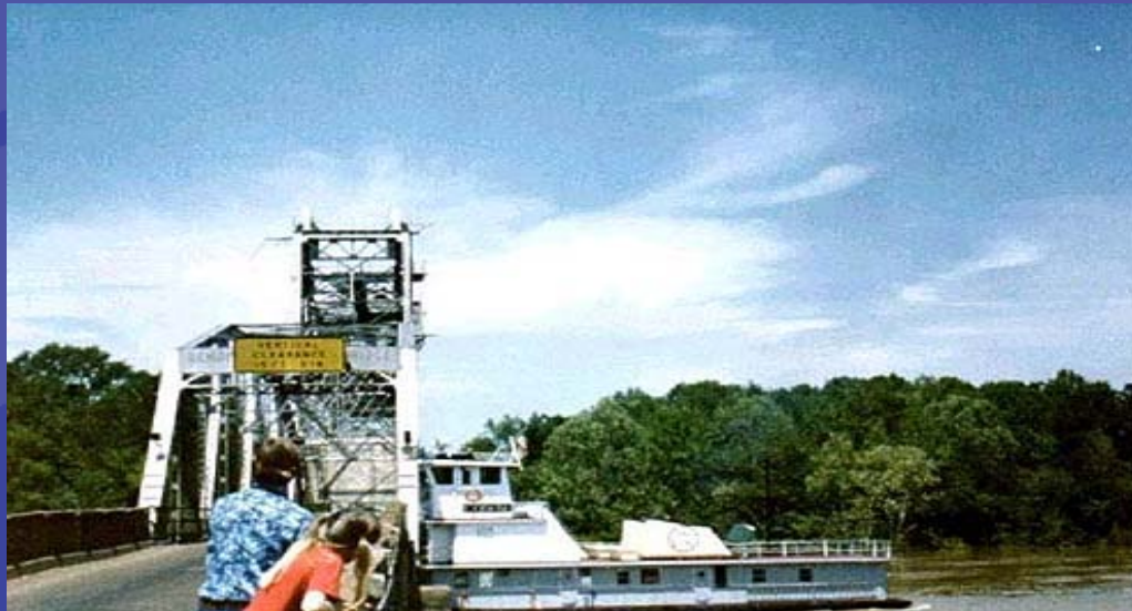
Tom Bigbee River